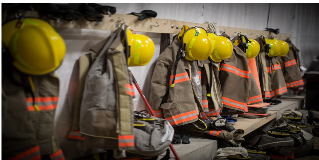
Figure 3: Emergency Response Team Safety Gear