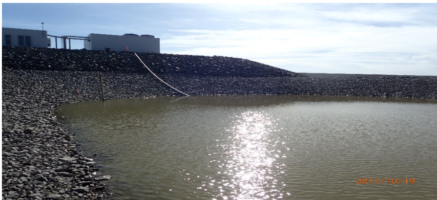
Figure 2: Water Management Pond Intake Structure, October 2017

The subsections that follow provide an overview of the activities conducted onsite during 2017.