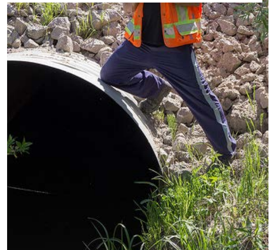
Figure 11 (bottom); Environmental Monitor Steve Jack conducting creek turbidity readings