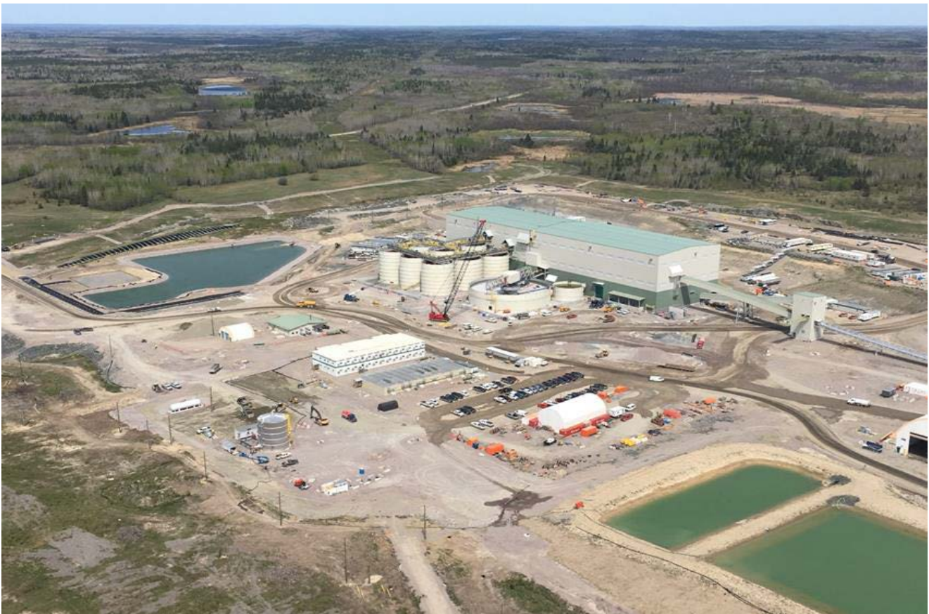
Figure 5: Plant Site Area May 2017

In addition to mining and stockpiling ore, the mine fleet was able to deliver material to the TMA and WMP to support construction of the dams.