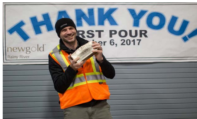
Figure 7: New Gold Employee at First Gold Pour