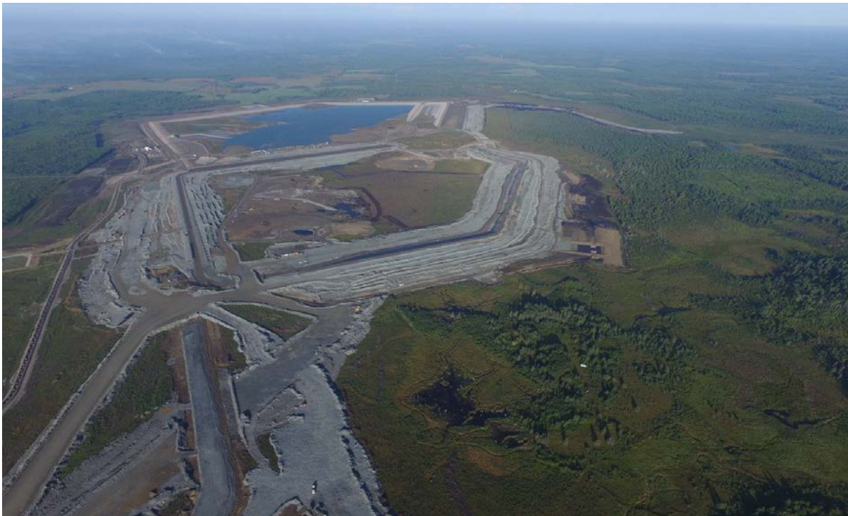
Figure 4: TMA facing west, September 2, 2017. Start up cell in foreground, water management pond in background

Construction activities in the TMA for 2018 will include the completion of cell 2 and cell 3, sediment ponds 1 and 2, water discharge pond, West Creek Diversion (tie in of Marr Creek) and temporary culvert removals