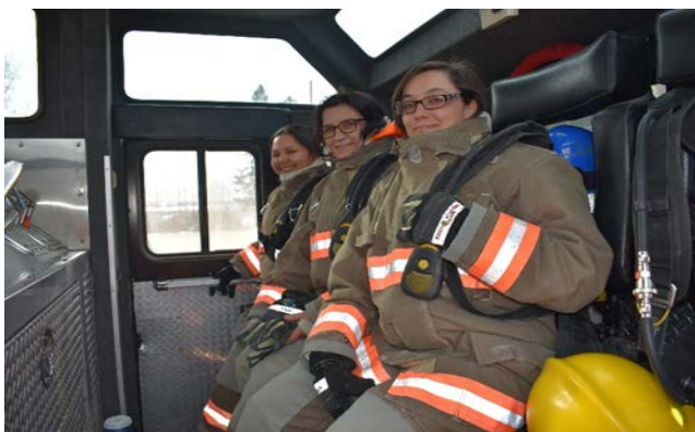
Figure 6: Emergency Response Team Training

In 2018, New Gold will continue to focus on hiring from local communities and developing our team members.