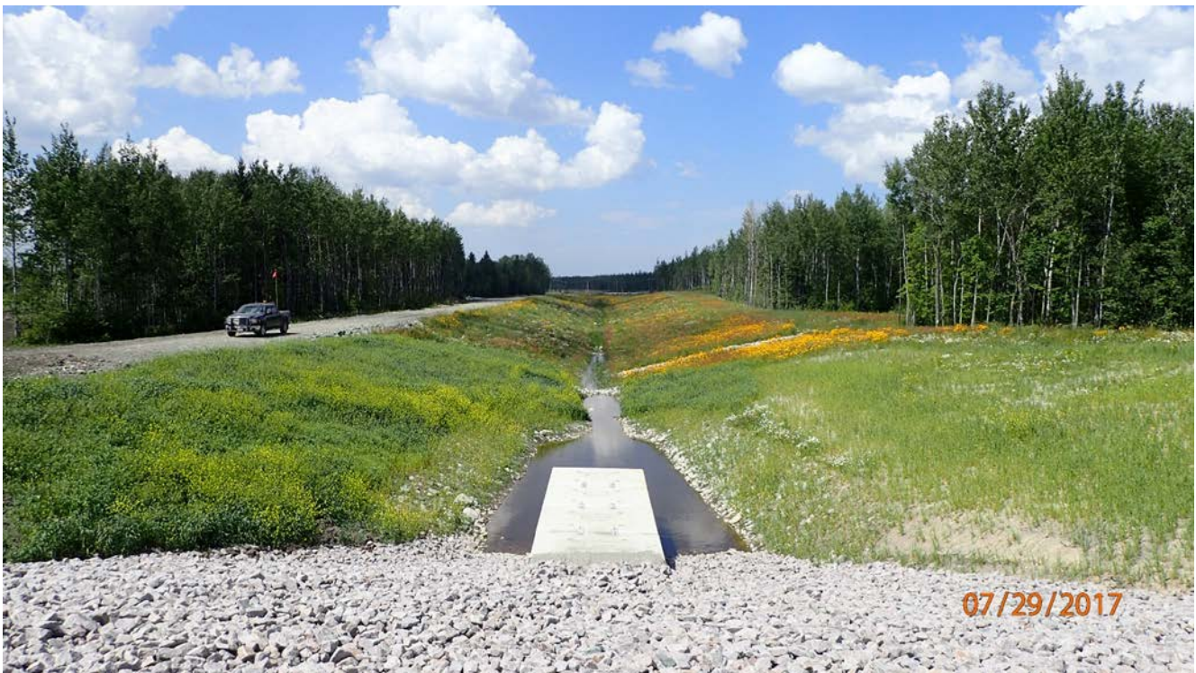
Figure 13: West Creek Diversion at the box culvert outlet, July 29, 2017