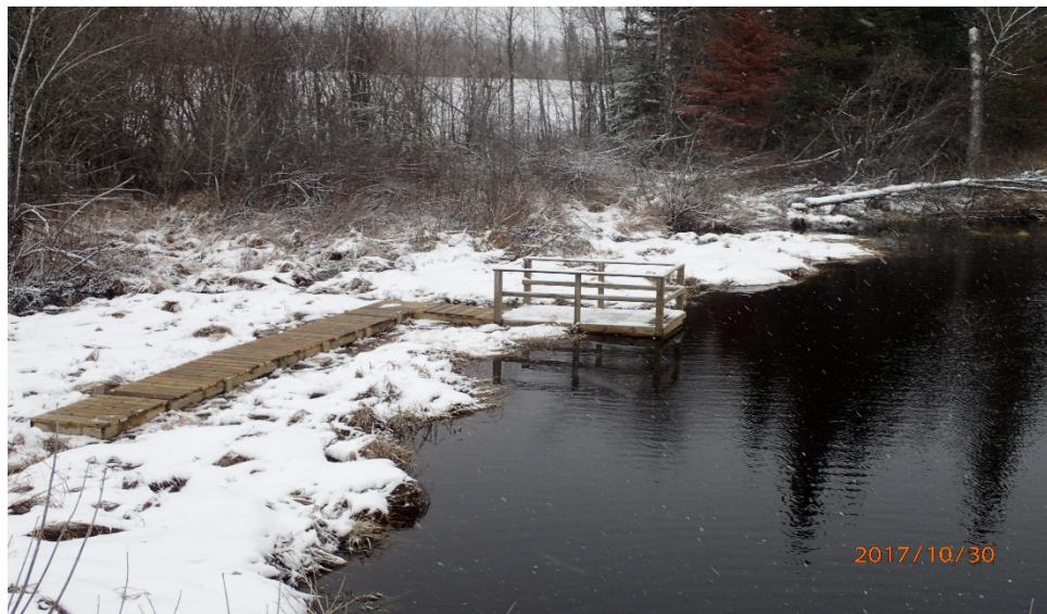
Figure 12: Water sampling platform installed on the Pinewood River

Information related to the environmental activities and monitoring that occurred in 2017 can be found in the following appendices of this report.