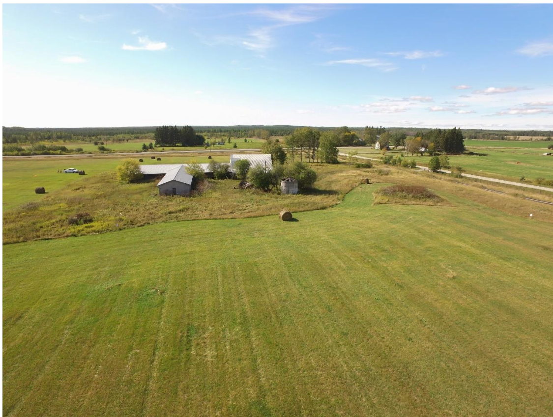
Figure 25 Drone flying over heritage lands west of Mine, August 18, 2018

Sylvie St.Jean Environmental Manager New Gold Rainy River Mine