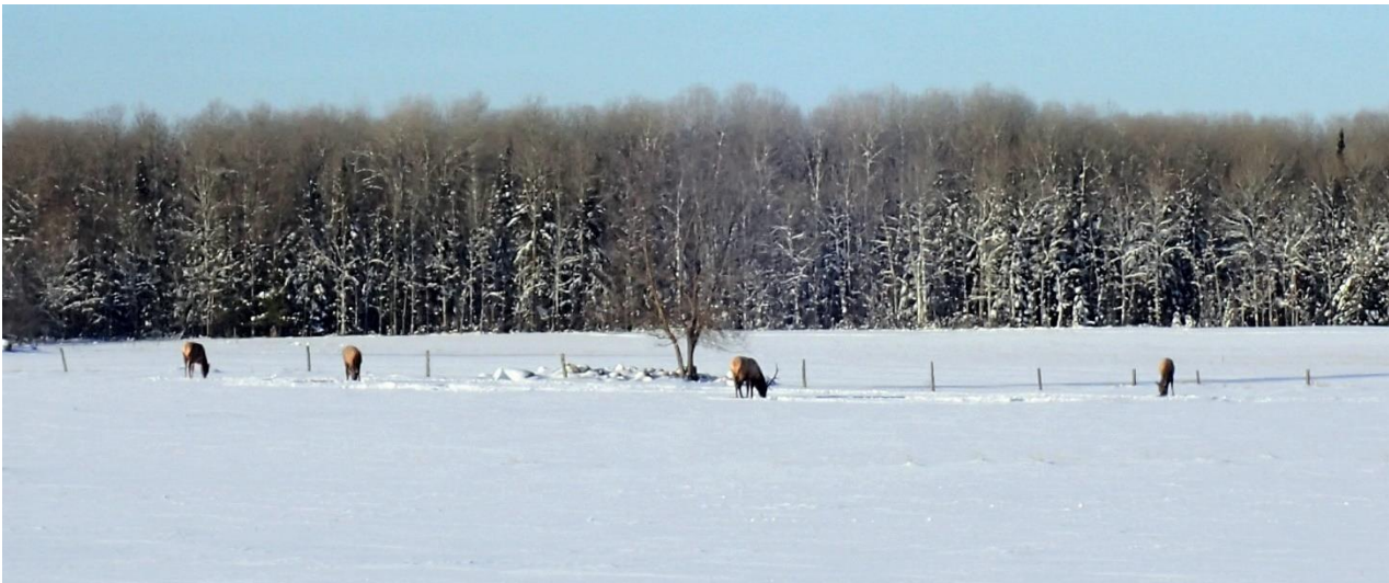
Figure 2 Elk in Field on HWY 617 January 4th, 2018

Key areas discussed in this report are; indigenous and community consultation, project development, reclamation activities, protection of fish and wildlife, migratory birds, health of indigenous peoples, site archaeology, heritage and cultural resources. This document also contains a summary of monitoring and research activities associated with water and air quality as well as wildlife and aquatic monitoring.