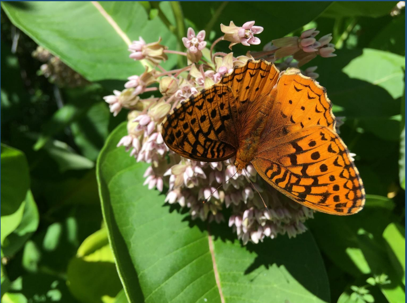
Figure 17 Aphrodite Fritillary on milkweed at pumphouse