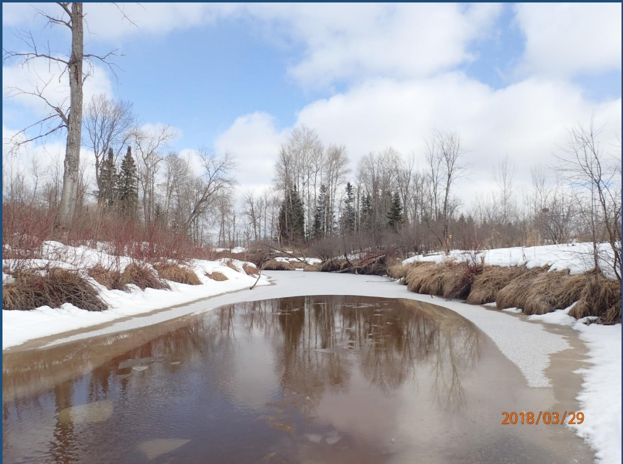
Figure 21 Pinewood River ice going out