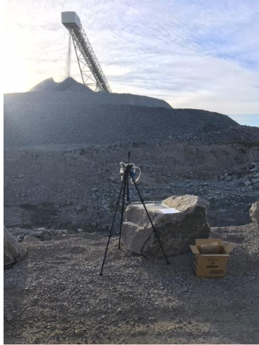
Figure 4 Occupational health sampling by maintenance wash trailers