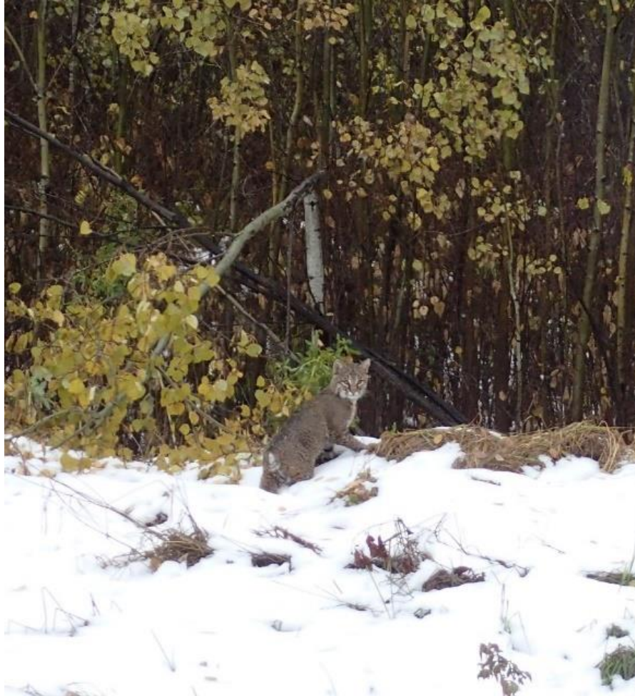
Figure 16 Bobcat kitten

Table 2 provides a summary of the environmental approvals related to the RRM.