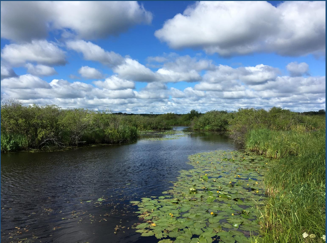
Figure 18 Pinewood River south of open pit