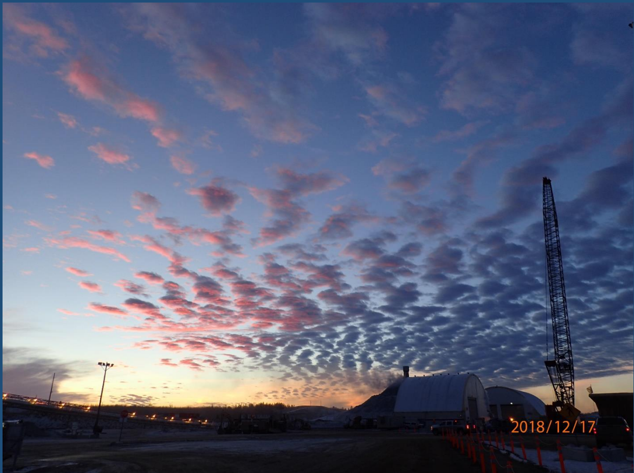
Figure 24 December sunrise