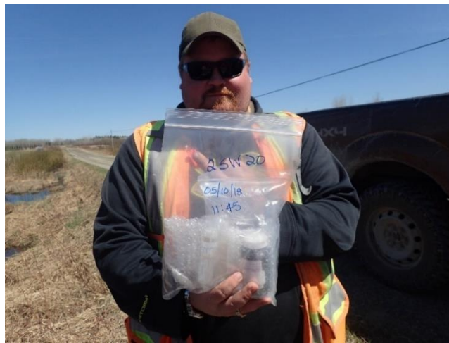
Figure 15 Sampling May 2019

On top of the above projects being completed, the environmental team continues to monitor air quality, wildlife, water quality, waste and the environment. They inspect areas around site to ensure second containment is in place, light plants are in the appropriate directions, hazardous storage areas are being kept tidy, waste is properly segregated, dust is kept to a minimum, wildlife is unharmed, and many others. The environmental department is a support role to the entire mine site.