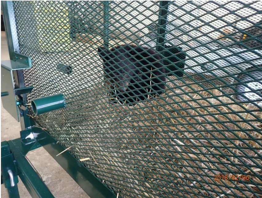
Figure 11 Orphaned bear cub

In January, New Gold acquired a mobile bear trap, designed and approved by the MNR, to trap and transport bears. In February, the team rescued an orphaned bear cub, See Figure 11, discovered on site. The cub was treated for hypothermia by a local veterinarian then transported to a rehabilitation center in southern Ontario.