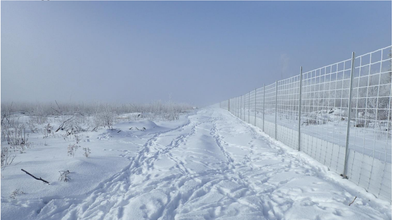
Figure 5 Exclusion fence and reptile barrier