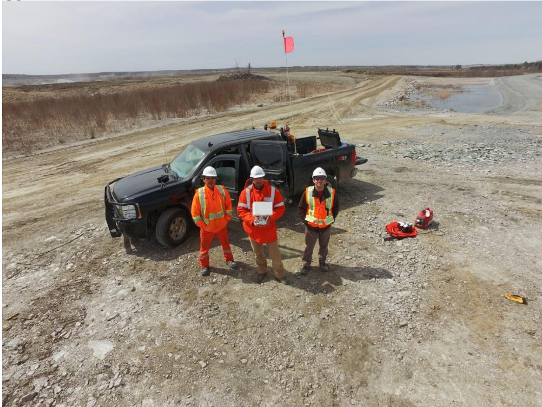
Figure 14 Enviro/GIS crew UAV selfie.

As the Rainy River Mine advances, the Environmental Department continues to be successful in their search to find efficient and effective means for conducting required monitoring. This also includes incorporating new projects into the department's routine, to aid in future mine reclamation.