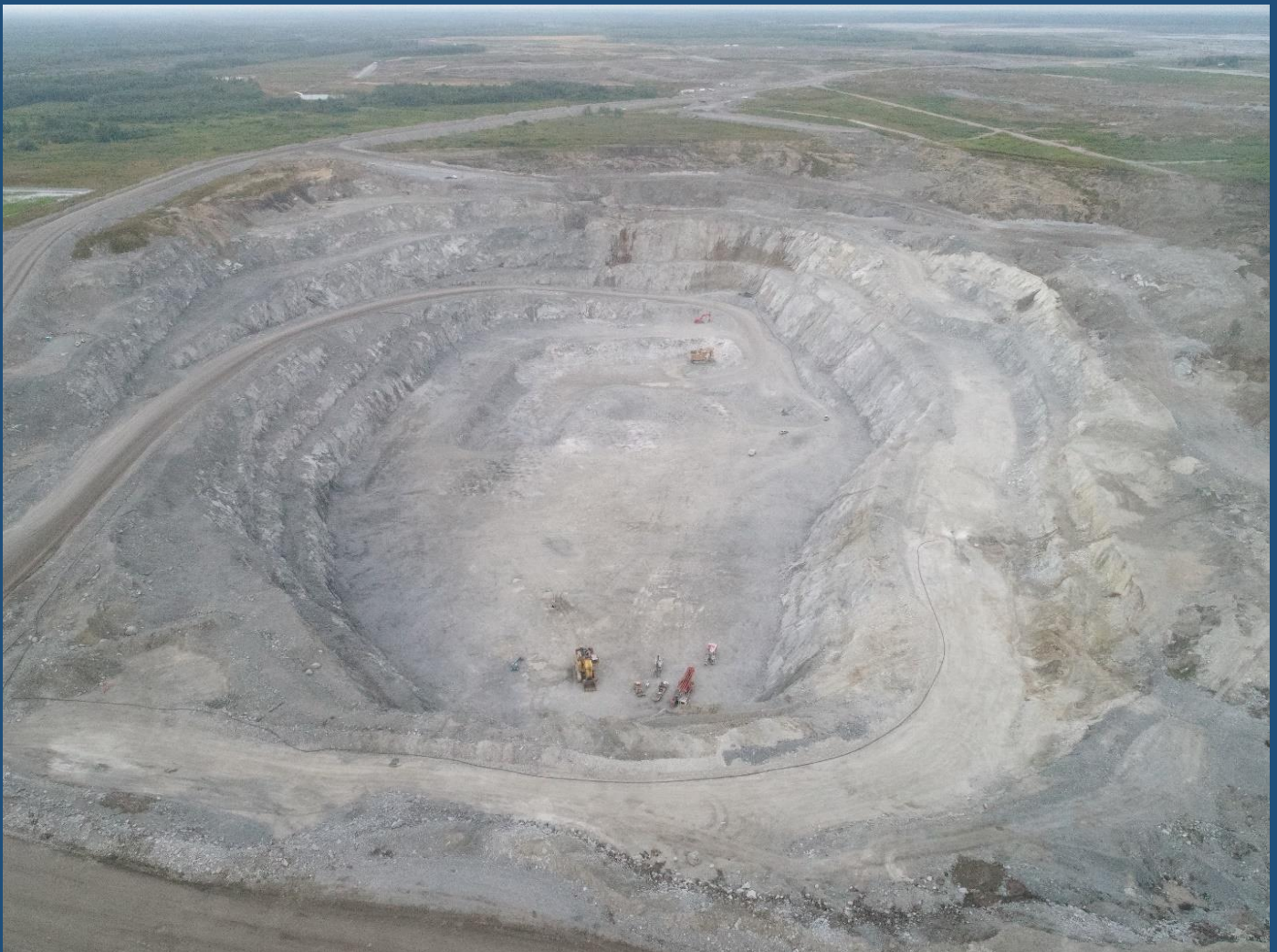
Figure 3 Open Pit Mine Summer 2018