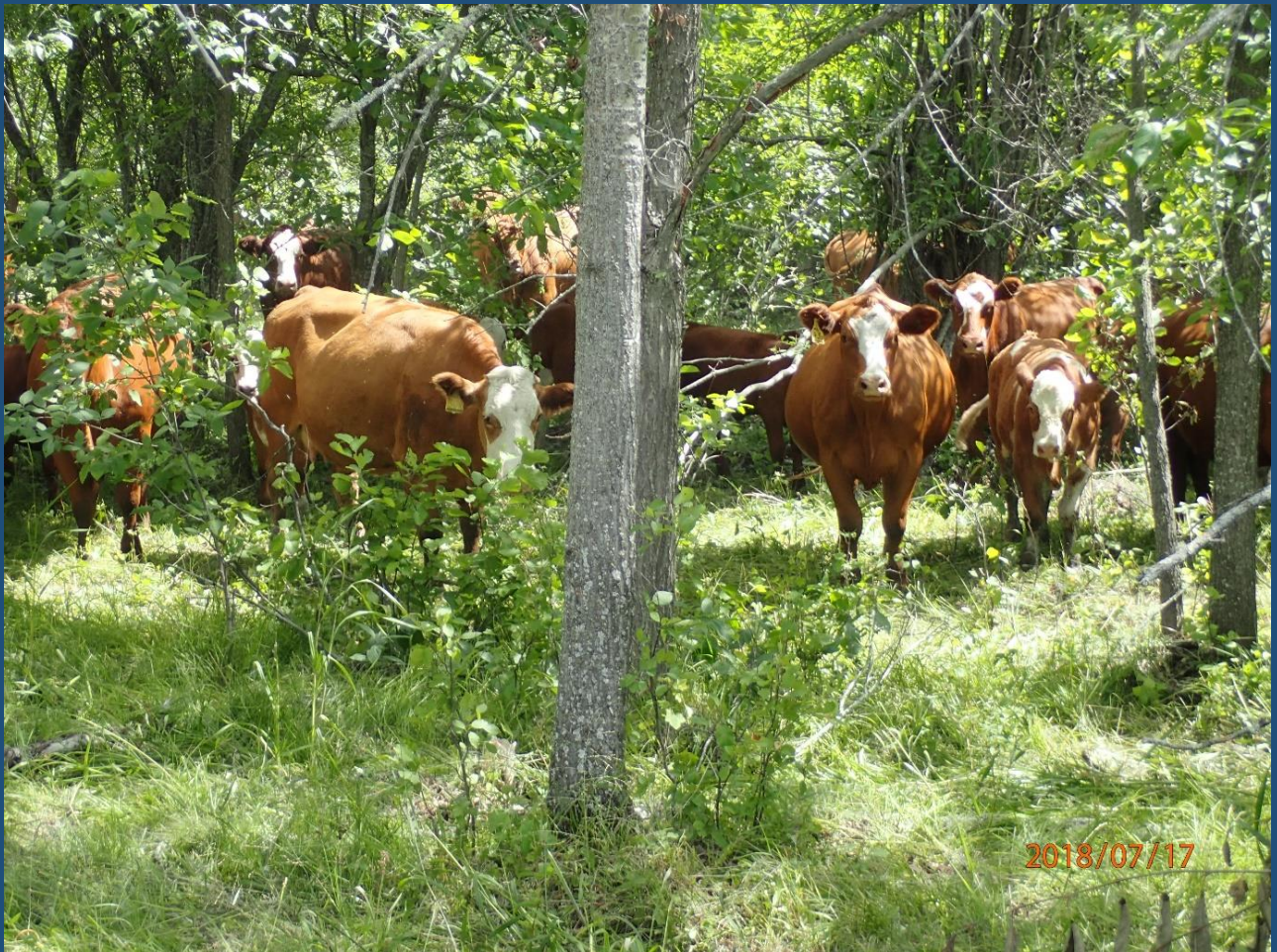
Figure 19 Cows at SW28A