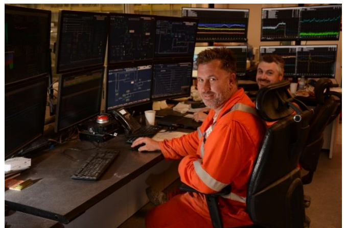
Figure 7 Mill operators