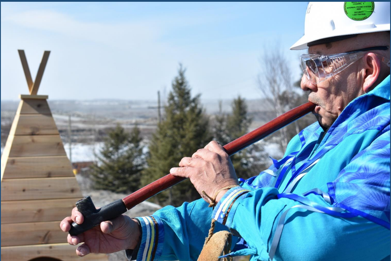
Figure 23 Spirit House March 2018