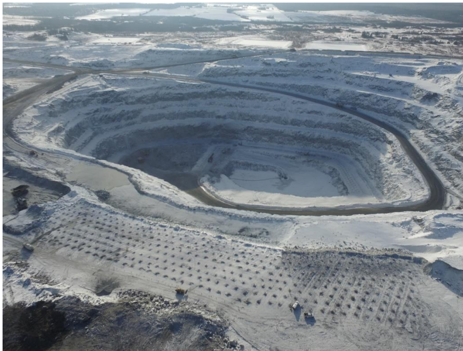
Figure 6 Southern facing aerial view of the open pit mine winter 2018

Open pit operations continued in Phase 1, which progressed down to the 230 elevation. In addition, development of Phase 2 of the open pit progressed to the 300 elevation. The mine also delivered construction material(rock) to the TMA to support construction of the dams.