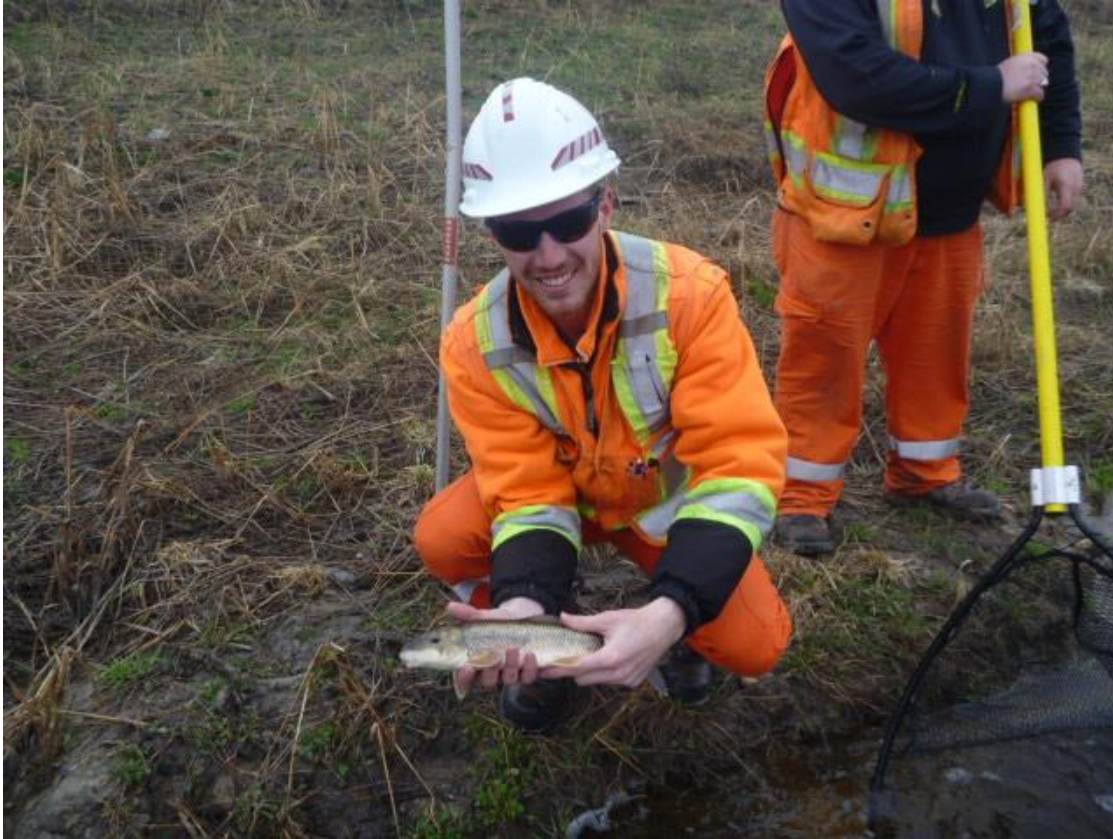
Figure 12 White Sucker spawning May 2018

During July and August, New Gold Environmental group hosted Stewardship Youth Ranger groups from Atikokan and Fort Frances. Group members were involved with tree planting, identification of fish bearing waterbodies and removal of dilapidated erosion and sediment control fences.