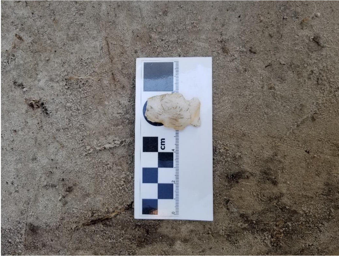
Figure 13 Arrowhead discovered during summer excavation

During 2018, the GIS Team continued to manage and advance the internal New Gold Rainy River Web GIS System (NGRR GIS); a distributed client/server GIS environment that provides instant access to up to date geospatial information to all New Gold employees and registered consultants (users) via web GIS and mobile applications. In 2018 the team has been working on developing an updated backend database structure and migrating critical environmental and other data to an enterprise GIS SQL Server Geodatabase on site. End users of the GIS System can now consume as well as create and update data on the server directly using future services within web GIS applications.