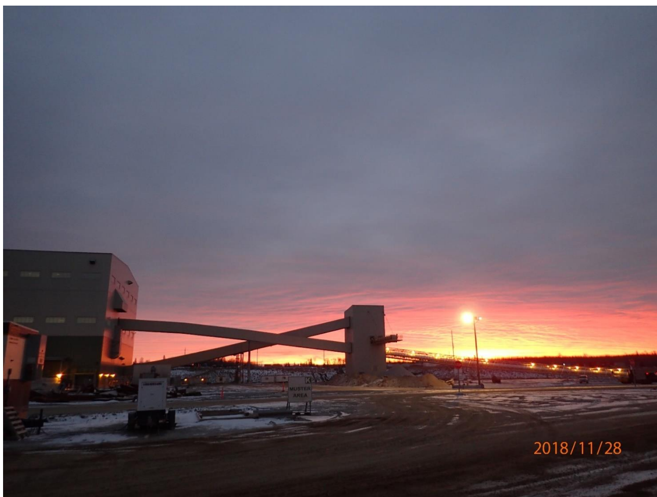
Figure 1 November Sunrise over the Mill 2018

Rainy River Mine 5967 Highway 11/71 PO Box 5 Emo, Ontario, Canada POW 1E0