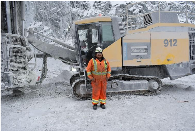
Figure 8 New Gold employee by a drill

In 2019, New Gold will continue to focus on hiring from local communities and developing our team members.