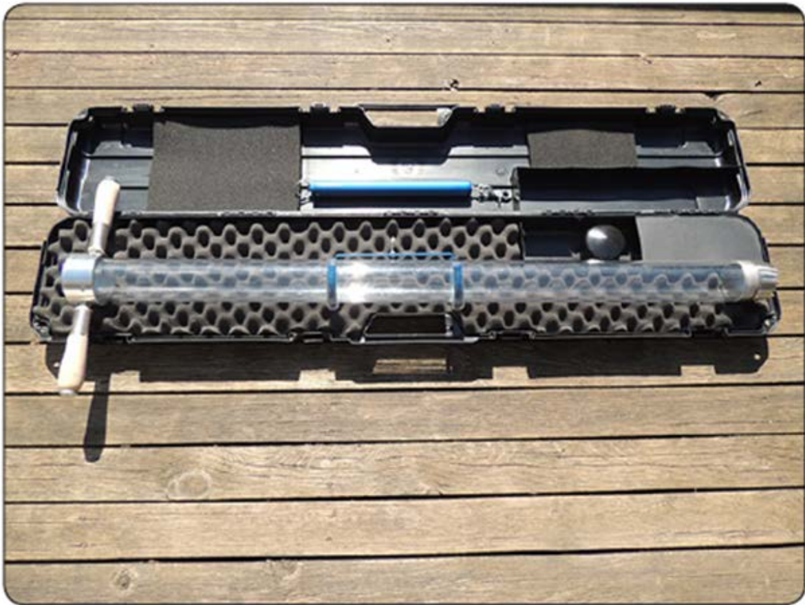
Figure 1: Metric Prairie Snow Sampler with Snow Scale and Hangar