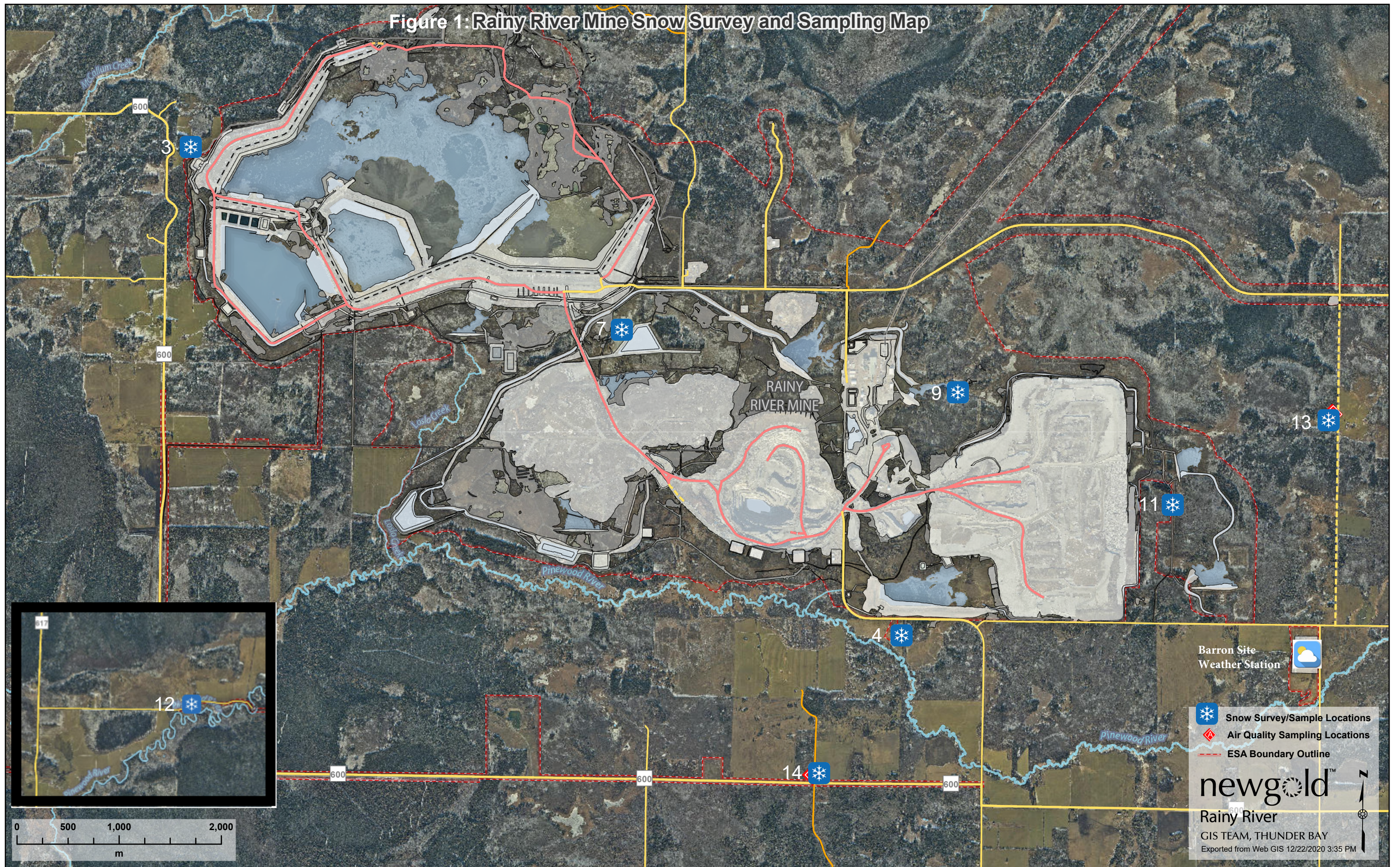
Figure 1: Rainy River Mine Snow Survey and Sampling Map