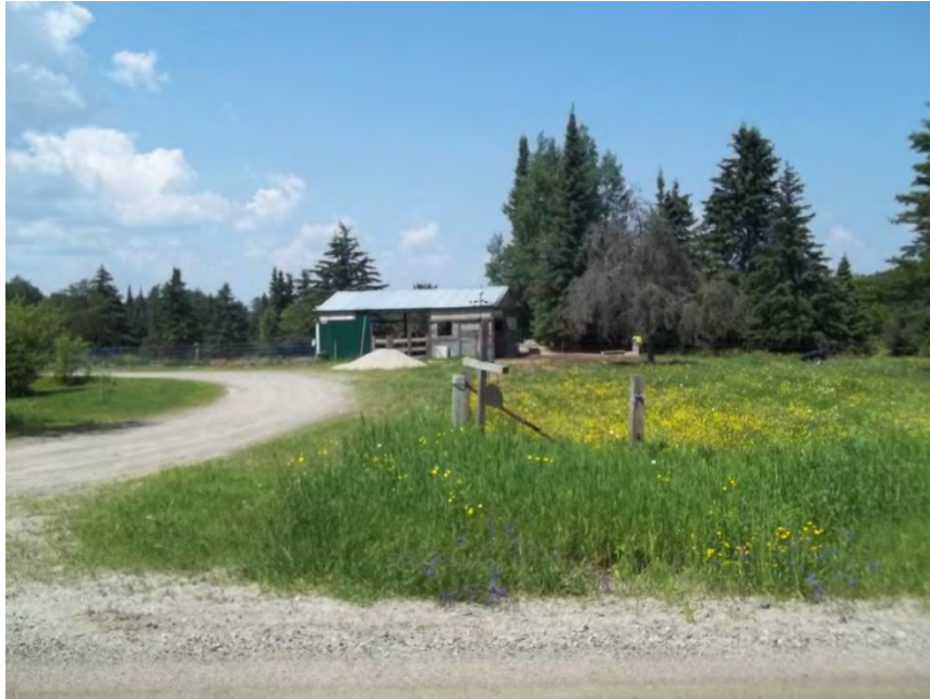
Figure 6: Receptor/Sampling Site #4