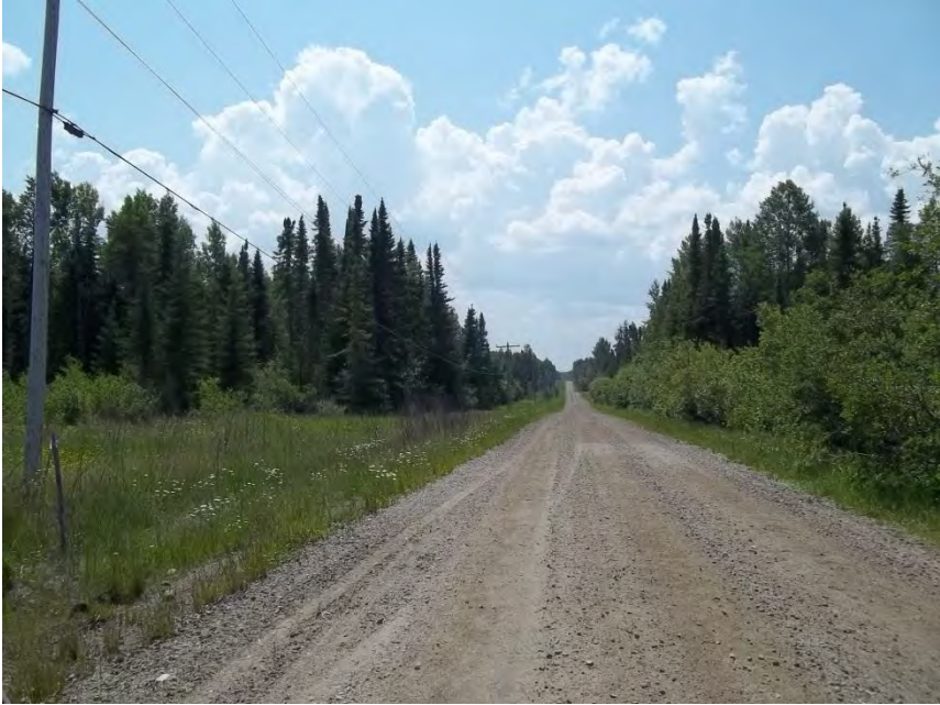
Figure 1: Typical Landscape in the Study Area