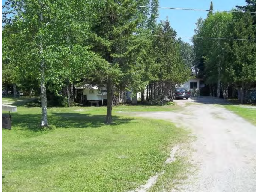
Figure 10a: Receptor/Sampling Site #8