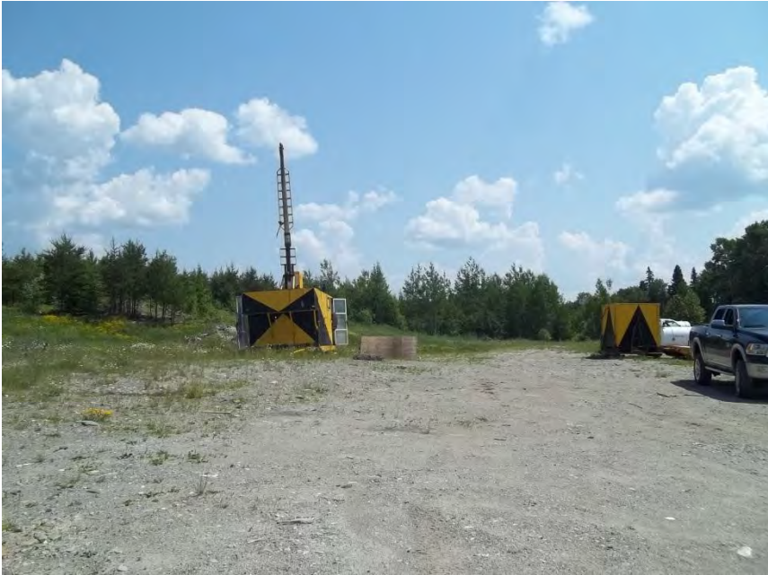
Figure 4: Receptor/Sampling Site #2