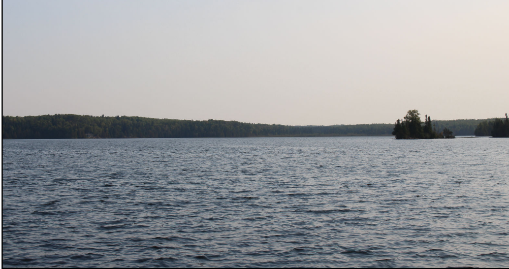
VIEW OF WRSA FROM THUNDER LAKE: PRE-DEVELOPMENT CONDITIONS