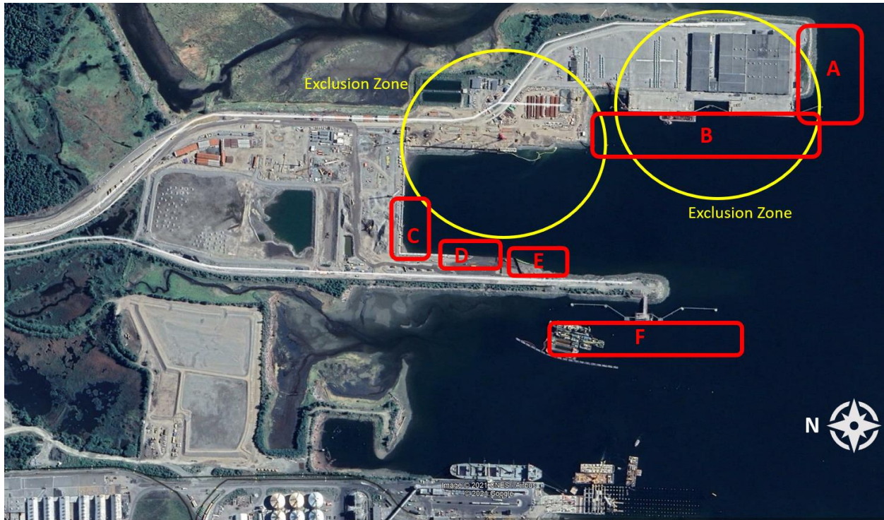
Figure 2: Tug Berth Option Locations (Yellow Circles Indicate Exclusion Zones)

From a biological perspective, the re-use of an existing area (Option F) that was previously an active wharf (Methanex jetty) is the preferred option as it is an existing disturbed area where existing piles, platform and jetty will be utilized in the new tug berth design; and does not require dredging and disposal of dredged sediment. The existing Methanex jetty was originally constructed in 1981 and went into service in 1982 for the shipment of methanol. Since then, it has undergone several modifications and upgrade programs. It was expanded in the late 1980s for ammonia shipments and again in 1992 for methyl tert-butyl ether (MTBE) (Advisian 2022a). In 2005, it was converted for import of condensate shipments. The existing Methanex jetty is shown in Figure 2 below.