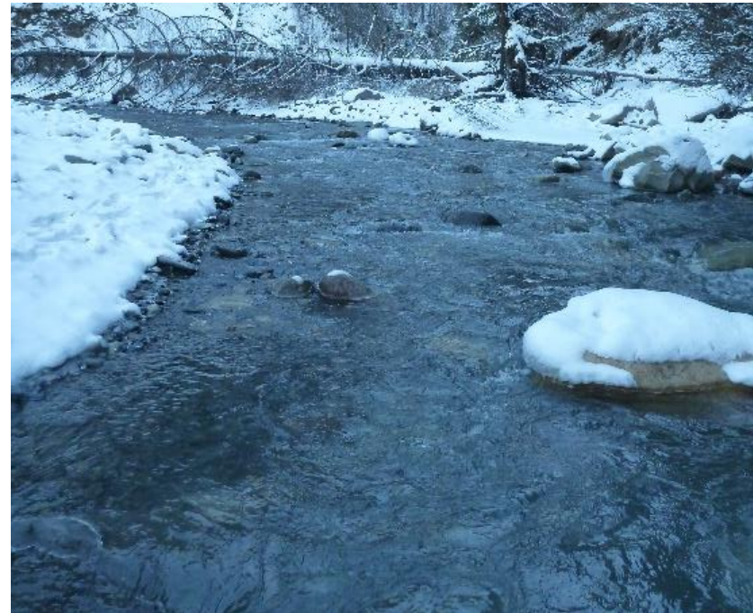
Photo 3: Road encroachment side channel, looking upstream, October 18, 2017