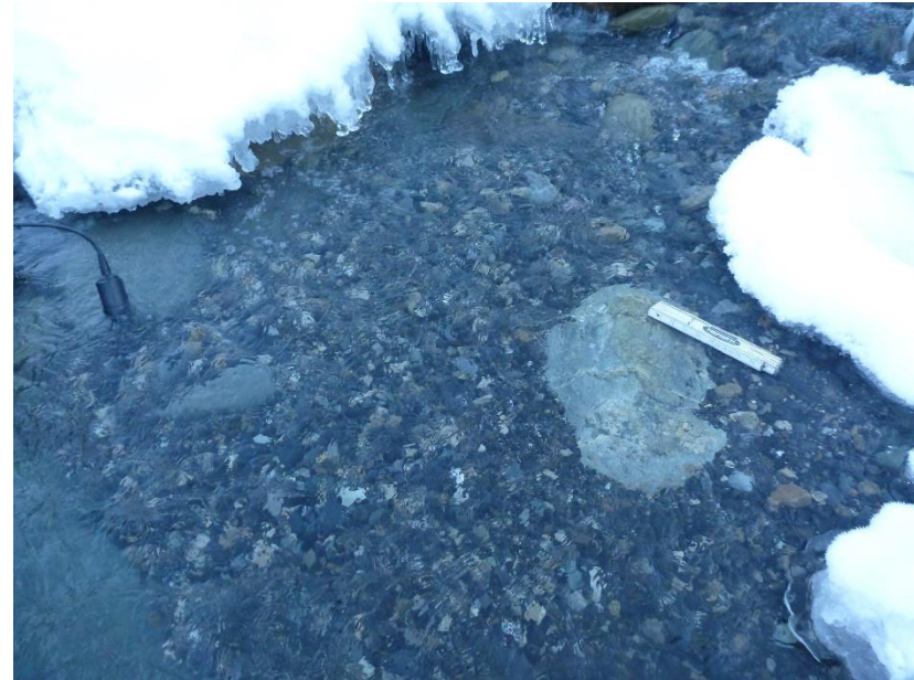
Photo 10: Gravel area at outlet of Swarm Creek to Bitter Creek, November 8, 2017