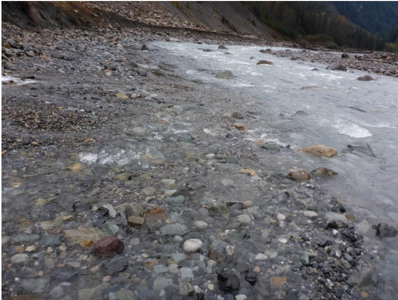
Photo 9: Shallow gravel bed on the side of Bitter Creek at Swarm Creek outlet, October 18, 2017