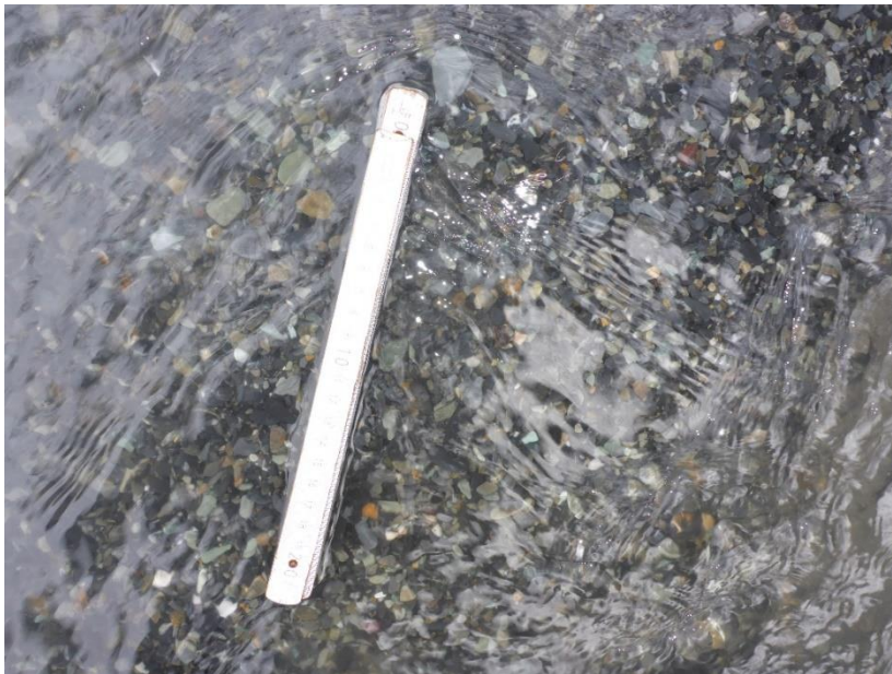
Photo 5: Small (0.3 m x 0.6 m) gravel bed near road encroachment side channel on Bitter Creek, October 18, 2017