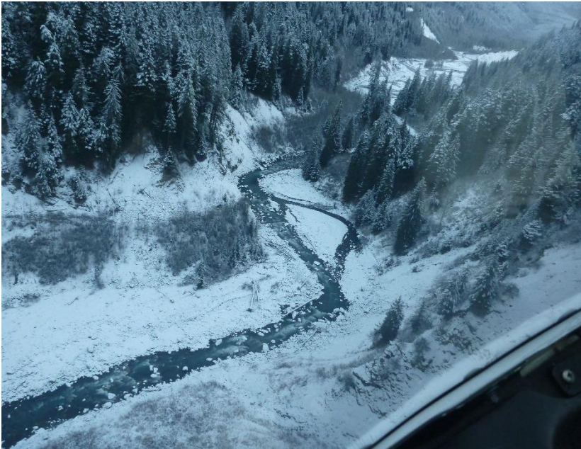
Photo 23: Bitter Creek Road Encroachment Area – Side Channel, November 8, 2017