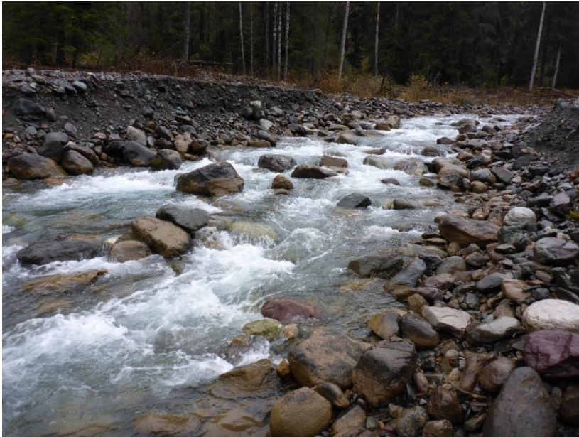
Photo 11: Downstream section of Roosevelt Creek near outlet to Bitter Creek, October 18, 2017