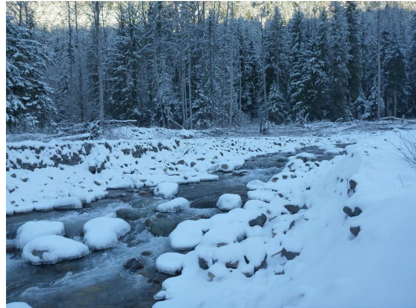
Photo 12: Downstream section of Roosevelt Creek near outlet to Bitter Creek, November 8, 2017