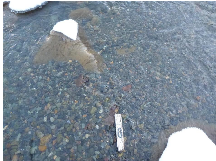
Photo 14: Gravel substrate at the upstream section of Roosevelt Creek, November 8, 2017