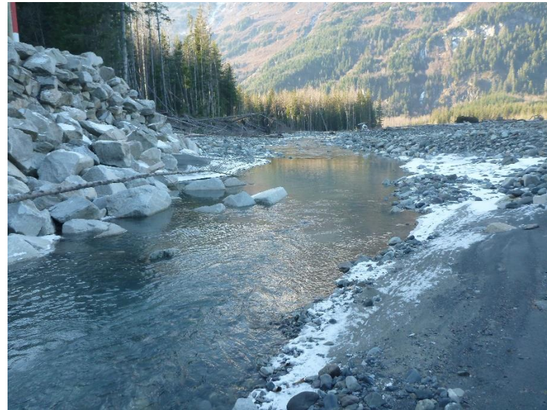
Photo 2: Lower Bitter Creek Side Channel, looking downstream, November 8, 2017.