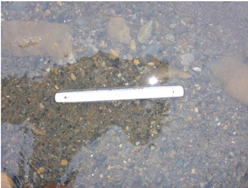
Photo 13: Gravel substrate at the upstream section of Roosevelt Creek, October 18, 2017