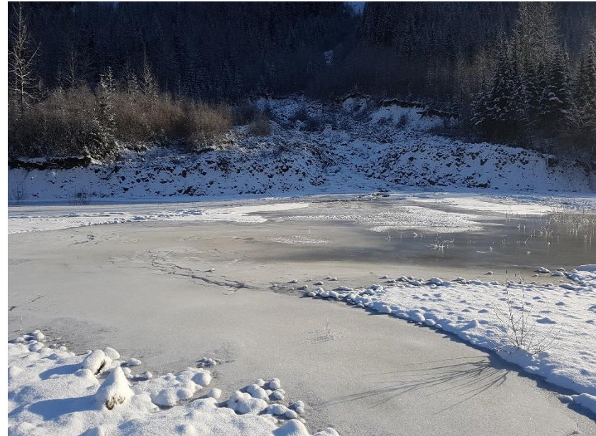
Photo 22: Hartley Gulch where it enters the Bitter Creek channel, November 8, 2017