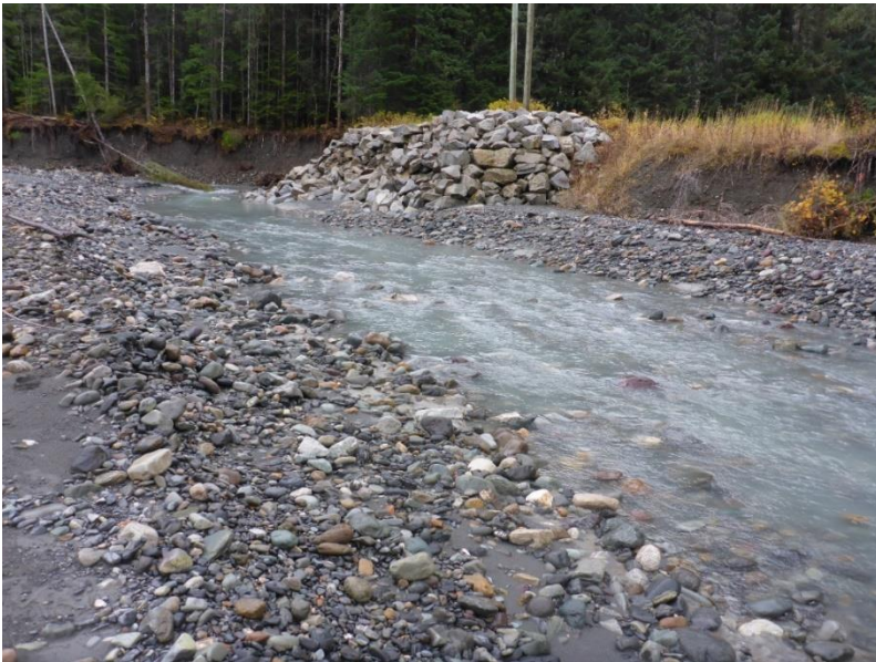
Photo 1: Lower Bitter Creek Side Channel, looking upstream, October 18, 2017.