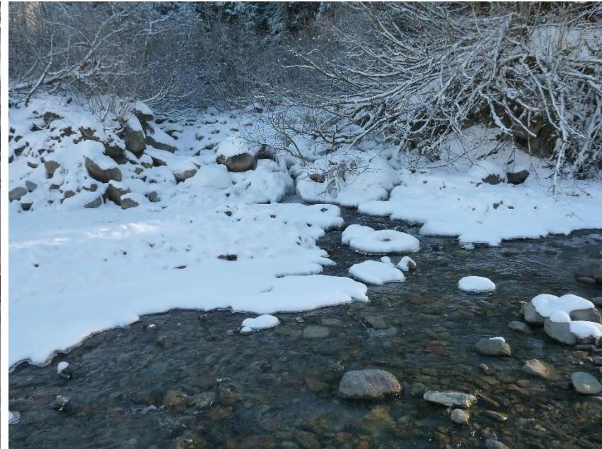
Photo 18: Upstream on Cambria Creek, where it flows into the Bitter Creek channel, November 8, 2017