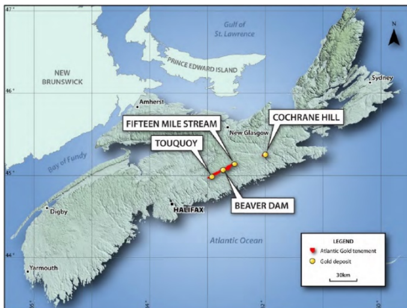
Figure 1 - Project Location Plan