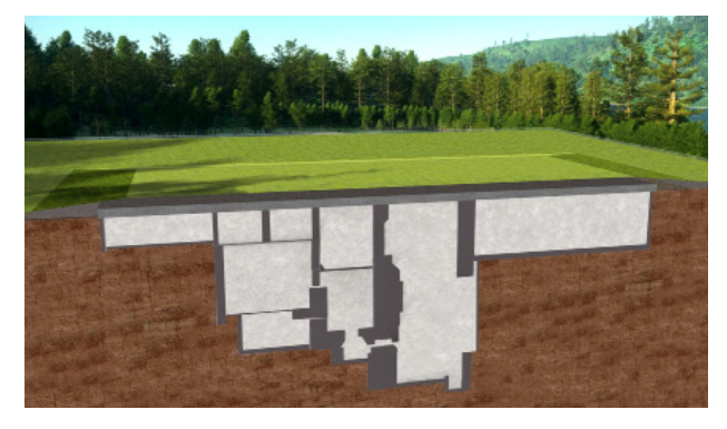
A depiction of the grouted facility

In the long term, following the defence-in-depth principle, the assessment has demonstrated that the failure of any of the physical engineered barriers will not compromise the performance of the system. It should be noted that while time is elapsing and eventually leading to the degradation of the engineered barriers (which is taken into account in the assessment), the radioactivity is progressively decaying. The assessment has shown that the effectiveness of the engineered barriers over time and as they progressively degrade is adequate to protect the ever-decreasing radiological hazard at any given point in time.