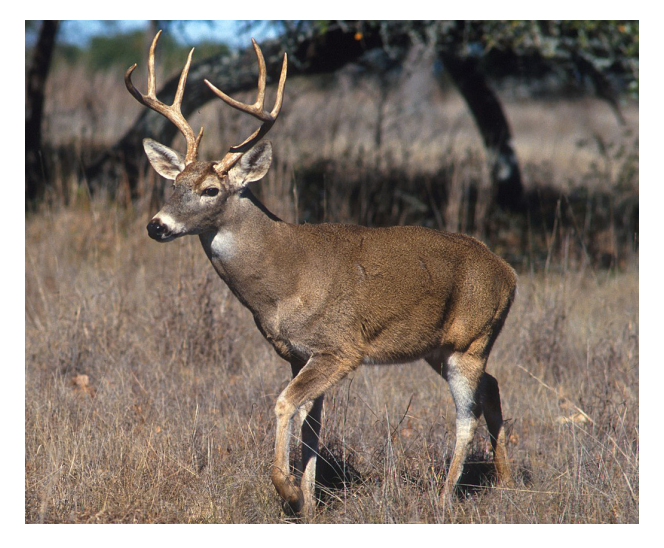
White-tailed deer are a popular game species in the region

Ongoing Aboriginal Engagement activities will be used to identify any changing concerns or perceptions related to the project, develop a greater understanding of Aboriginal traditional knowledge and verify the accuracy of EA predictions related to Aboriginal land and resource use.