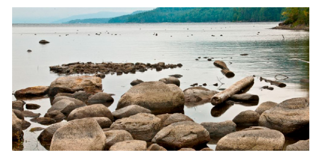
An identified interest: the Ottawa River

CNL's Aboriginal, and public and stakeholder engagement programs identified interest in a number of VCs, including: water quality in the Ottawa River, chimney swift, and land use and planning. No adverse residual effects were identified for these VCs. Engagements are on-going through the EA process.