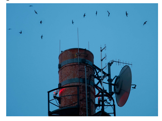
Chimney swifts entering the NPD ventilation stack at sunset

Monitoring activities such as the measurement of groundwater quality, flow and direction will be carried out during the Decommissioning Execution and Institutional Controls phases to verify the accuracy of the EA predictions and the effectiveness of mitigation measures.