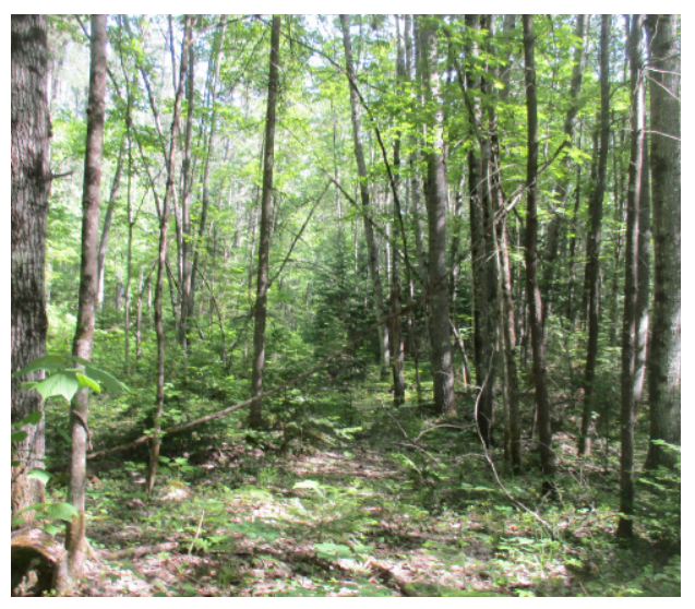
Forest on the NPD property

A number of Species at Risk (SARs) are known to be present at the NPD site including: chimney swift, eastern milksnake, bald eagle, common nighthawk, eastern wood pewee, eastern small-footed bat, little brown myotis, northern myotis and monarch butterfly.