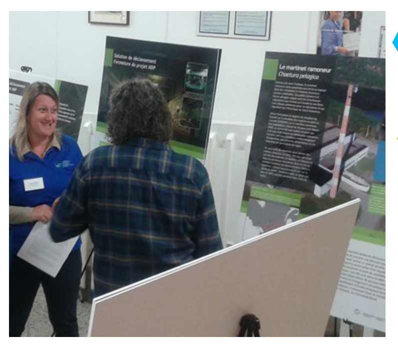
CNL staff member answering questions at a public information session

These activities have helped inform stakeholders, and have enabled the public to provide valuable feedback into the project, which helps CNL understand areas of public concern and improve the project design and EIS. Key concerns voiced from the outreach activities are listed below, along with CNL's plan to address these issues: