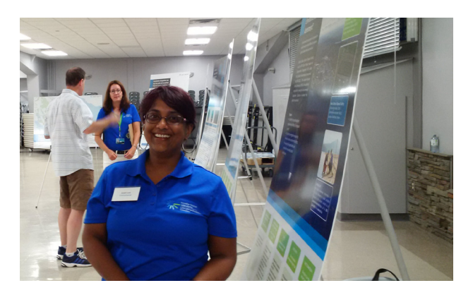
CNL staff at a public information session in June 2016

Decommissioning Execution activities could produce nuisance effects (i.e., noise, dust and traffic) for nearby residents and land users. The project footprint could affect landscape and visual setting from the Ottawa River. Mitigation measures in other environmental components, such as dust suppression, timing of decommissioning activities and