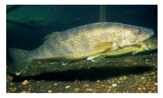
A socio-economic environment VC: the walleye

In the Decommissioning Execution phase, project activities such as equipment wash out and demolition have the potential to affect aquatic biota through potential contamination of runoff. Example mitigation measures include dust suppression and runoff diversion.