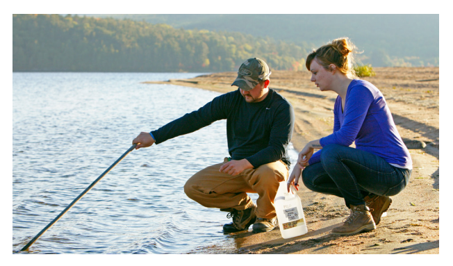
Monitoring the Ottawa River

Monitoring for parameters of concern in air, as well as air emissions and greenhouse gas estimates will be carried out to verify the accuracy of EA predictions and the effectiveness of mitigation measures. Monitoring will occur primarily in the Decommissioning Execution phase, since this is when the most air emissions and noise are expected to occur.