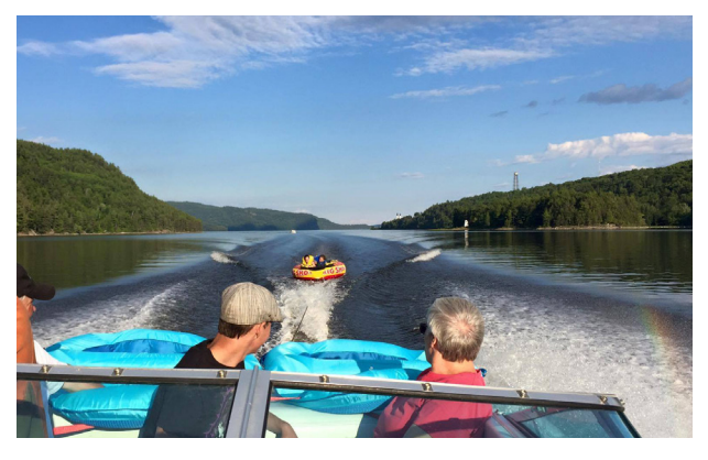
Boating on the Ottawa River

receptors. Based on the severity of the dose, and the probability of occurrence, all bounding scenarios were determined to have negligible risk.