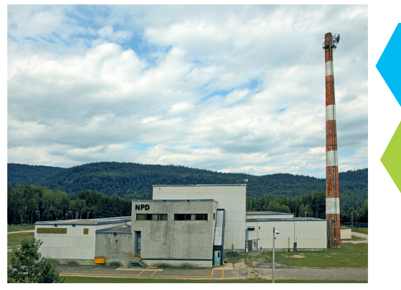
NPD as it appears today

The purpose of the proposed project is to safely decommission the NPDWF, ensuring a reduction of Canadian legacy long-term liabilities and eliminating interim waste storage, while reducing worker risk and transport/waste handling risk.