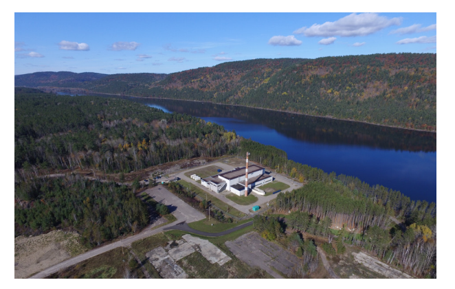
Aerial view of the NPD site

varies between environmental components to capture the interaction of effects from the project with the effects of other projects within each component.