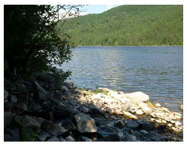
A view from the NPD site; for more than 50 years, NPD has been safely operated and maintained beside the Ottawa River

The climate in the region surrounding the NPD site is classified as humid continental, with warm summers, cold winters, and no distinct dry season. The average daily temperature ranges from a high of 20.2°C in July to a low of -12.0°C in January, with an average annual temperature of 5.6°C. The wind conditions at the NPD site are considered to travel predominantly along the Ottawa River valley. From 2011-2015, the region received an average of 779 mm of precipitation annually, with average monthly precipitation ranging from 24.7 mm to 96.9 mm per month.