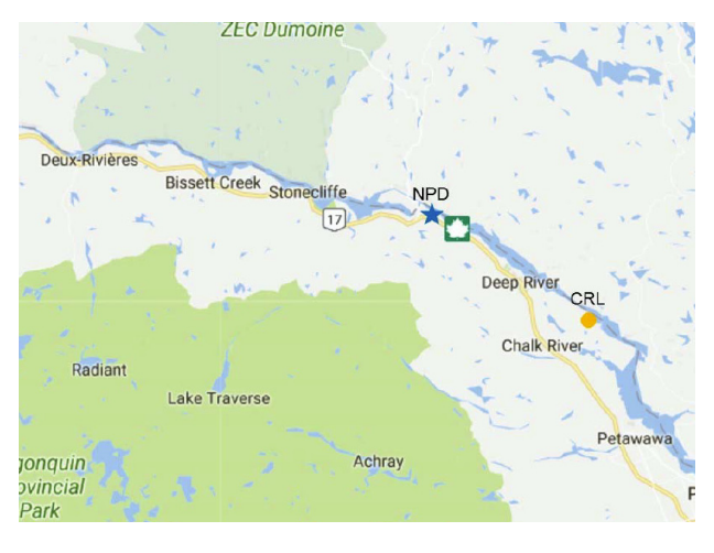
Location of NPD

The Nuclear Power Demonstration (NPD) site is located in Rolphton Township, in the Town of Laurentian Hills in Renfrew County, Ontario, Canada, on the south bank of the Ottawa River, about 25 km upstream of the Chalk River Laboratories (CRL) site, and approximately 200 km northwest of Ottawa.