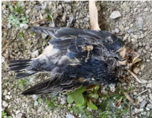
25 June 2023

(Dead nestling, found near exclusion netting - the exclusion netting applied by the construction team on site is in a manner that appears unsafe for birds)