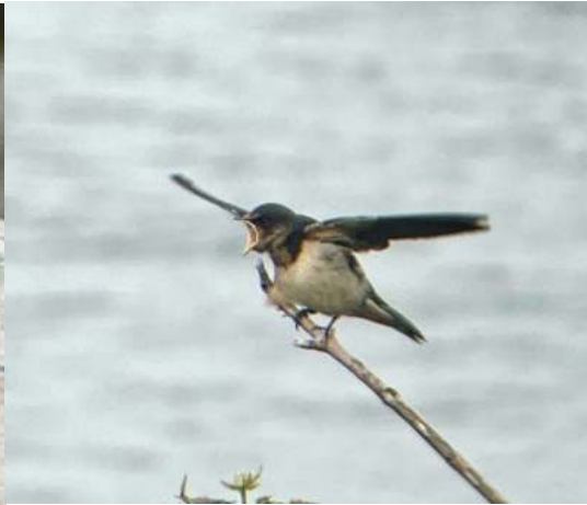
15 July 2023