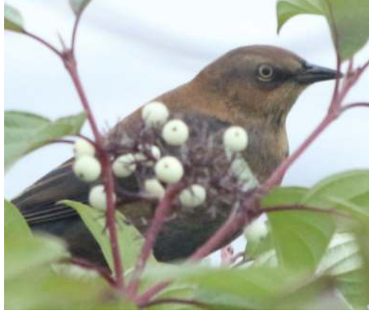
24 September 2022