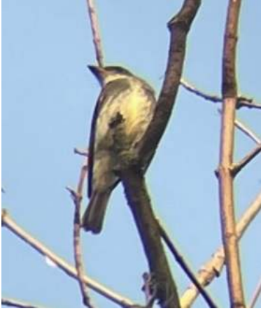
23 August 2021