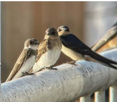
1 Aug 2022