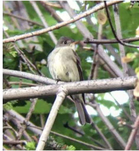
20 May 2021