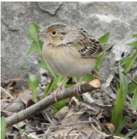
26 April 2022