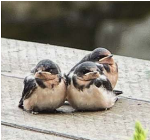
23 Aug 2022