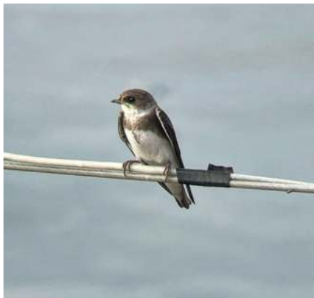
14 Aug 2022