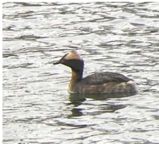
18 April 2023