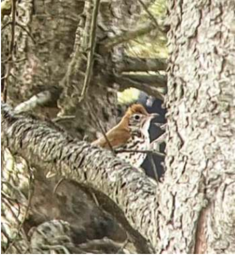
9 May 2022