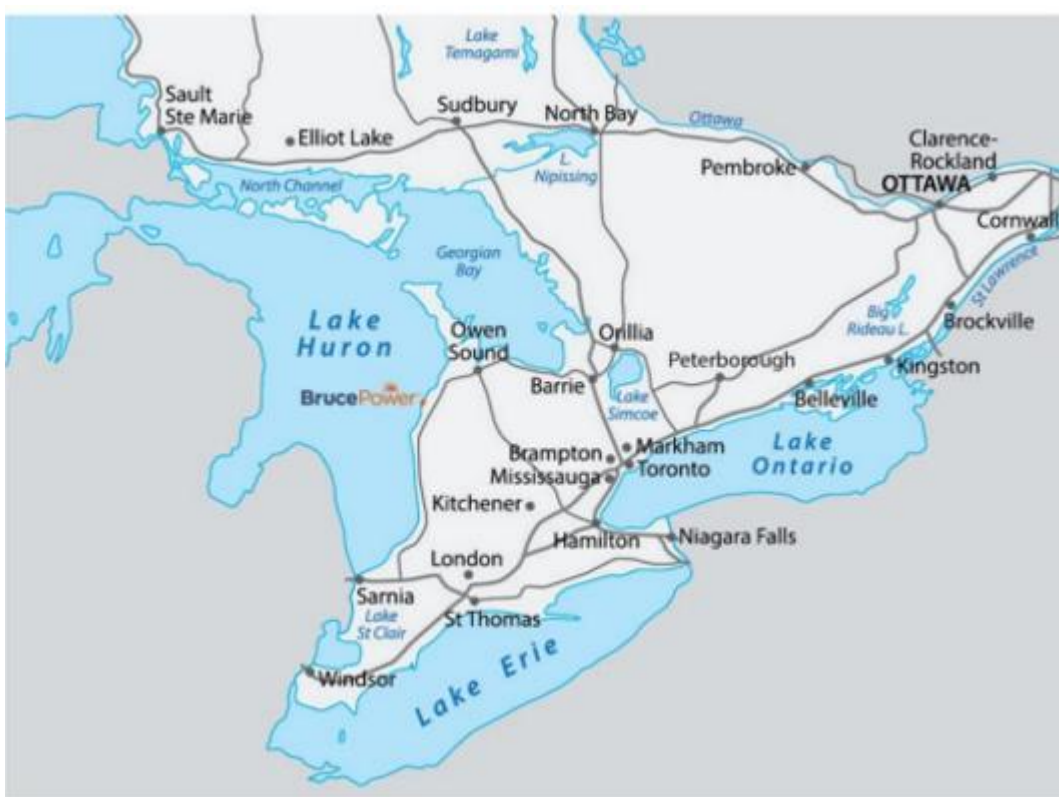
Figure 1: Project Map

For more information on the Bruce C Nuclear Project or to read more information and comments received, visit the Canadian Impact Assessment registry (the registry) at Bruce C Nuclear Project .