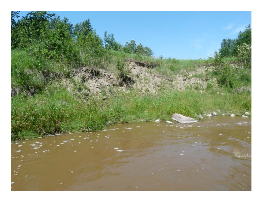
Photo 38. Point E on Figure 6.3.1-3 near the mouth of Peonan Creek looking north.

Photo 37. Point E on Figure 6.3.1-3 near the mouth of Peonan Creek looking east.