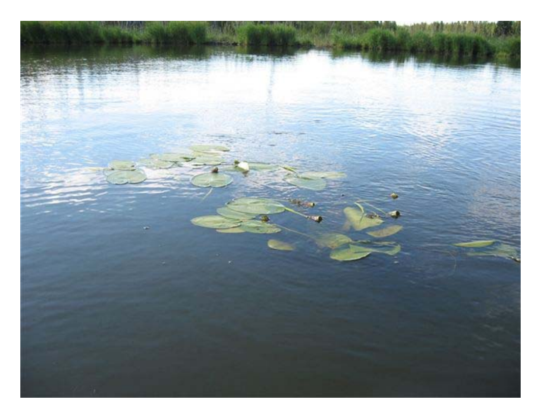
Photo 11. 101 Ravine located mid-reach near the overburden and rock storage area.