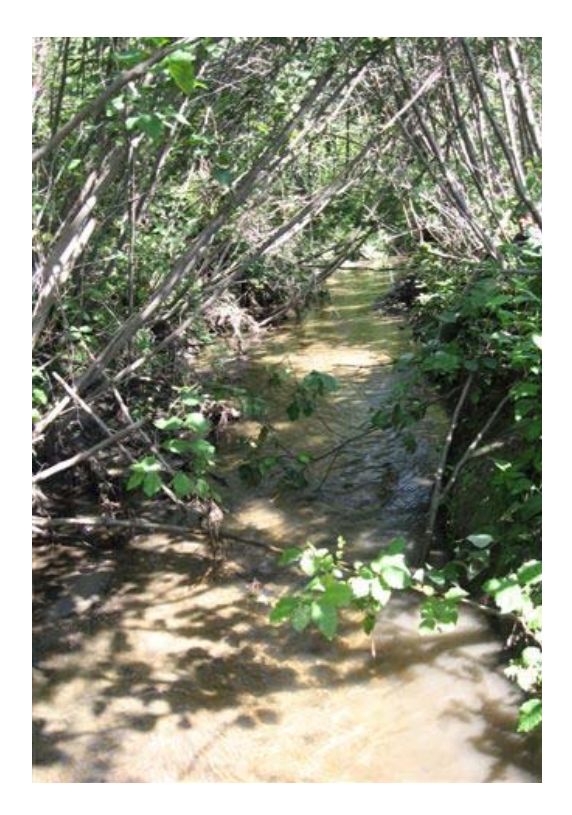
Photo 10. 101 Ravine immediately upstream of the log jam located near the mouth.

Photo 9. 101 Ravine immediately upstream of the log jam located near the mouth.