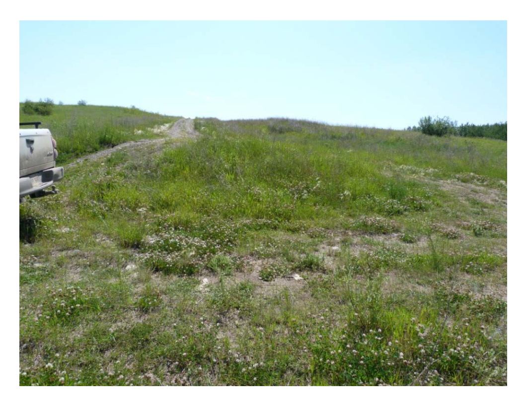
Photo 30. Point B on Figure 6.3.1-3 on Peonan Creek at the road crossing.

Photo 29. Point A on Figure 6.3.1-3 on Peonan Creek looking south.