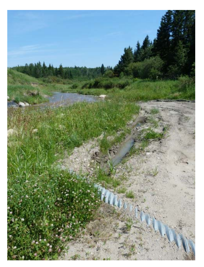
Photo 32. Point B on Figure 6.3.1-3 on Peonan Creek at the road crossing.

Photo 31. Point B on Figure 6.3.1-3 on Peonan Creek at the road crossing.