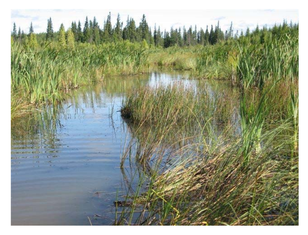
Photo 12. 101 Ravine located mid-reach near the overburden and rock storage area.

Photo 11. 101 Ravine located mid-reach near the overburden and rock storage area.