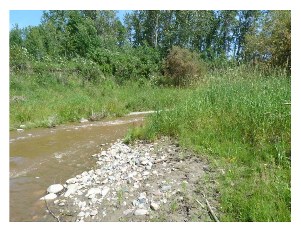
Photo 37. Point E on Figure 6.3.1-3 near the mouth of Peonan Creek looking east.