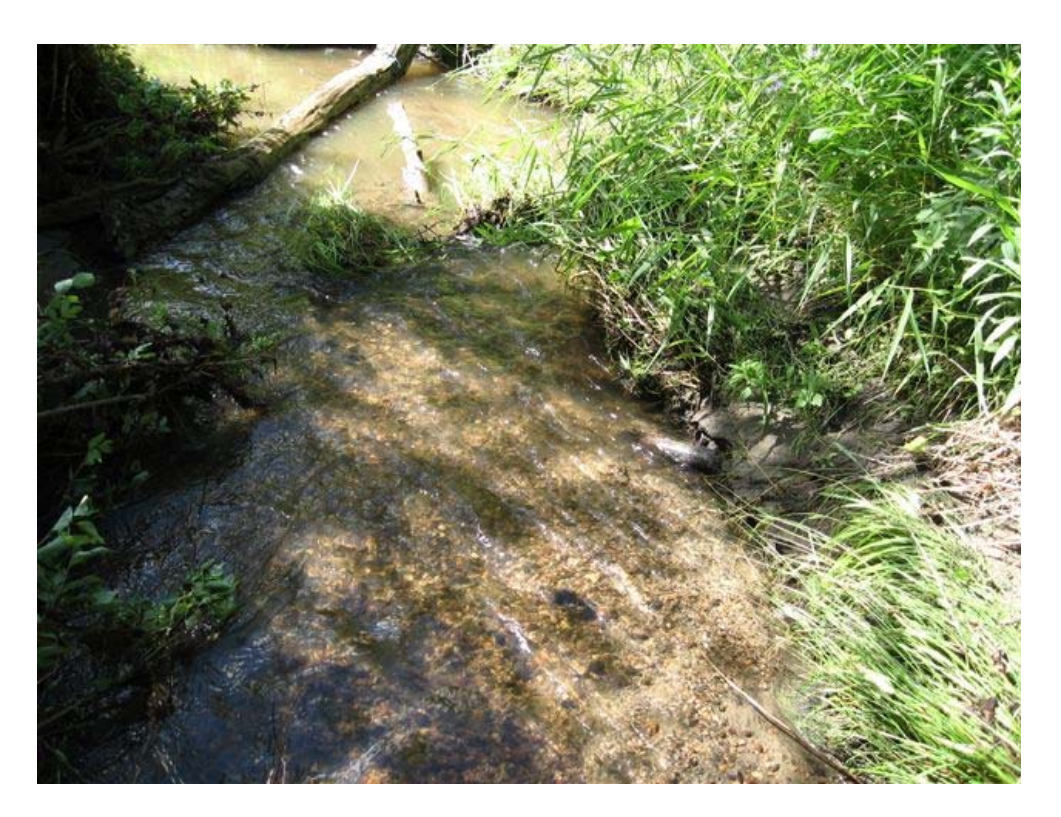
Photo 9. 101 Ravine immediately upstream of the log jam located near the mouth.