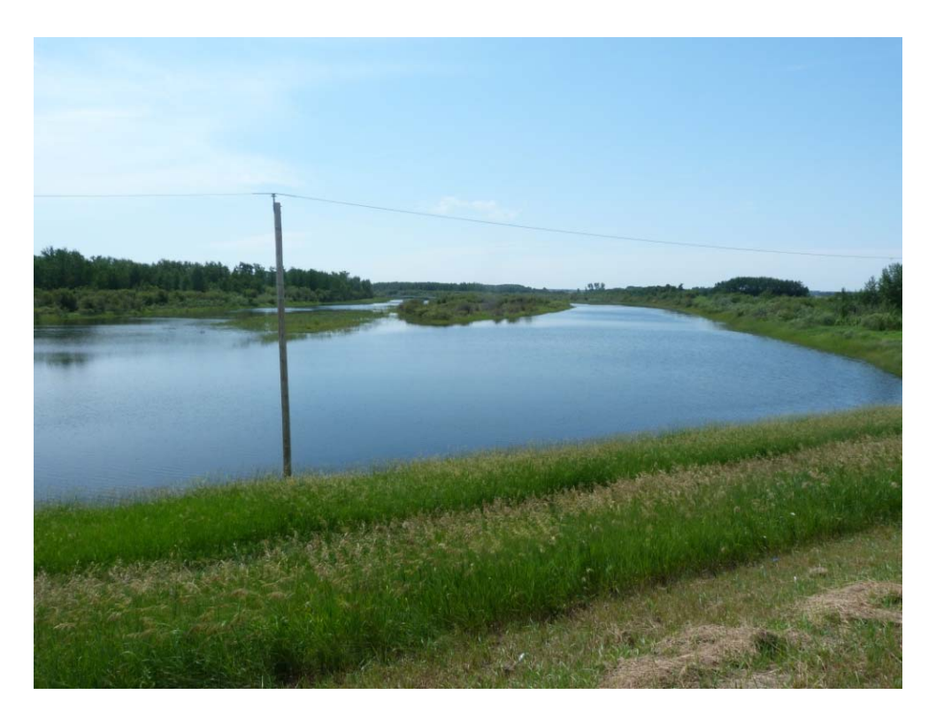
Photo 27. Looking south from the highway at Muskoday bridge (approximately 465780E, 5881635N).