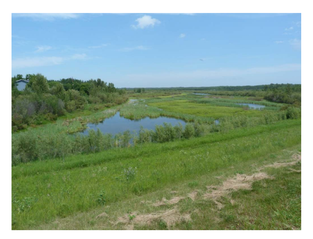
Photo 26. Looking north from the highway at Muskoday bridge (approximately 465780E, 5881635N).

Photo 25. Saskatchewan River at FALC Ravine.