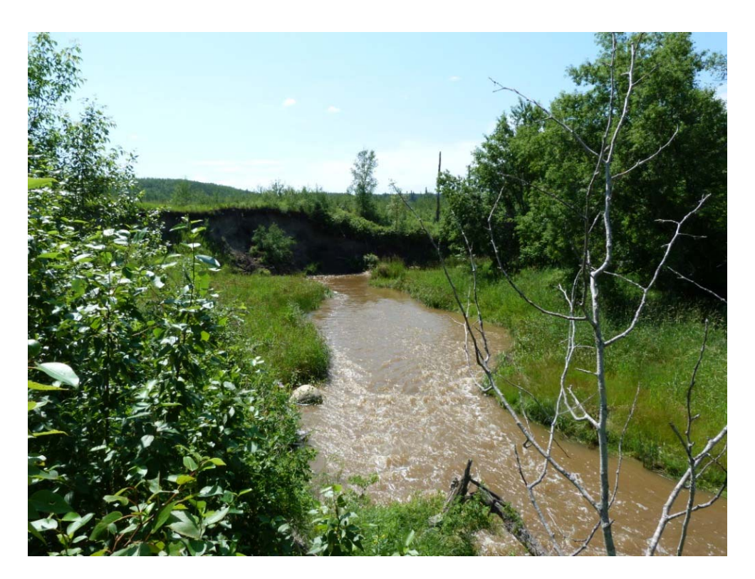
Photo 36. Various locations between Points C and E on Figure 6.3.1-3 on Peonan Creek.

Photo 35. Various locations between Points C and E on Figure 6.3.1-3 on Peonan Creek.