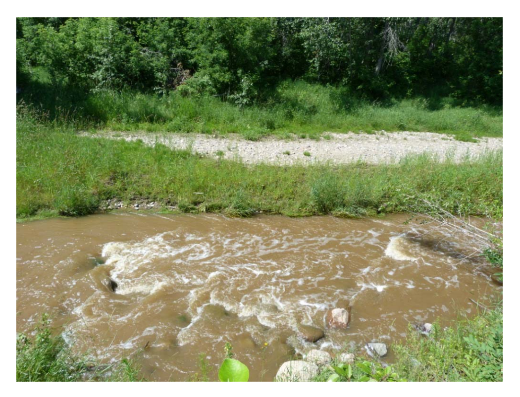
Photo 35. Various locations between Points C and E on Figure 6.3.1-3 on Peonan Creek.