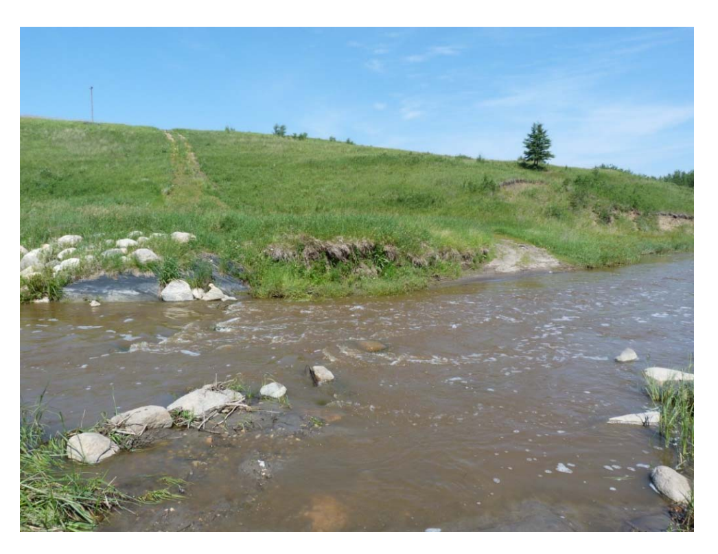
Photo 31. Point B on Figure 6.3.1-3 on Peonan Creek at the road crossing.