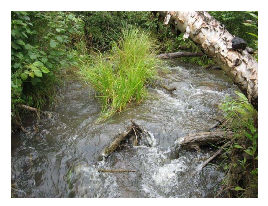
Photo 14. East Ravine representative of potential white sucker spawning habitat.